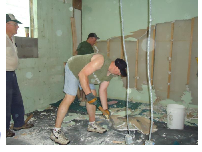
Or just search Open Arms Christian Church!

Check out some of the great work everyone did! And if you would like to see more find us on Facebook at: <u>https://www.facebook.com/pages/Open-Arms-Christian-Church/125361084188844</u>